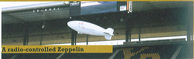
A radio-controlled Zeppelin

What is the average speed of the wind in your stadium? This is not one of John Cleese's questions in the film Monty Python and the Holy Grail , but one of the questions the HeLIHOPP team asks its customer whenever they want to fly a radio-controlled object in a stadium for sponsoring purposes. Since 2002, HeLIHOPP has made a name for itself as an advertising agency focusing on the deployment of inflatable promotion tools at sporting events. During that time, the agency has gathered precious knowledge of 'lighter than air' radio-controlled flying objects, and can now develop tailor-made Zeppelin-shaped inflatables. At the moment, the company is designing a new 7-10m 3 , radio-controlled Zeppelin for a 32,000-capacity stadium in Switzerland. This stadium is a real challenge for the designers and pilots, as the air circulation is very tricky, and the standard Zeppelin configuration didn't fulfil the expectations of the stadium owner. The owner wanted greater deployment reliability for sponsors, and greater safety for the fans in case of strong winds. Therefore, a new envelope shape and several engine configurations were developed to fulfil all the customer's requirements, and new flying tests have been organised. These developments are necessary